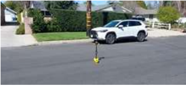
Connection to city sewer line. Depth about 10 ½’.