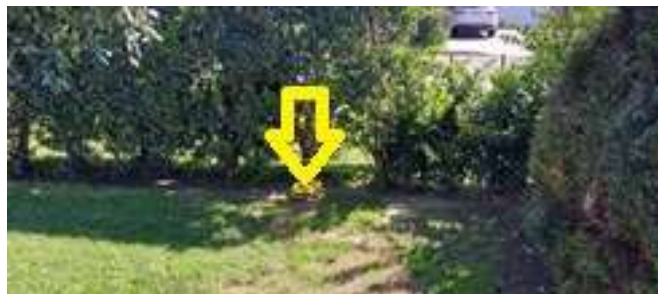
Transition from 4" to 6" diameter clay pipe. Depth about 5 1/2'.