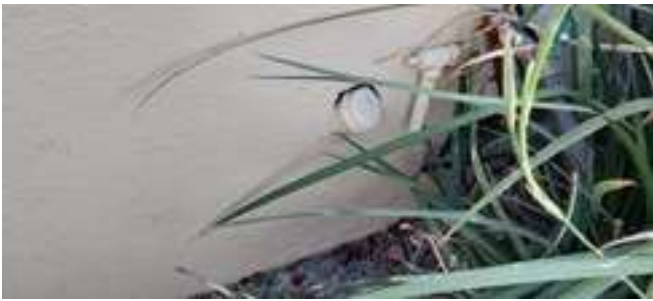
Additional small wall cleanout. Not used for today’s inspection.