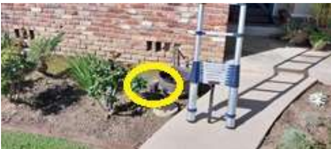
Cleanout used for today's inspection.

Important note: All locations below are provided based on our best attempts at isolating the path of the main sewer line and its important transitions. Locations and depth estimates are not always accurate. Your contractor is ultimately responsible for verifying or accepting these locations before excavating any portion of the system.